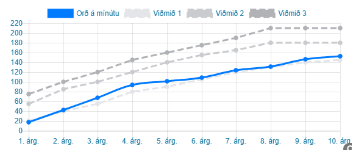
Figure 2. Average number of correct words per minute (blue line) and benchmarks 1, 2 and 3 (grey lines) by year group.

benchmark 3 for the end of the school year (spring). Focused coaching should make it possible for all year groups to attain the reading goal specified by benchmark 2.